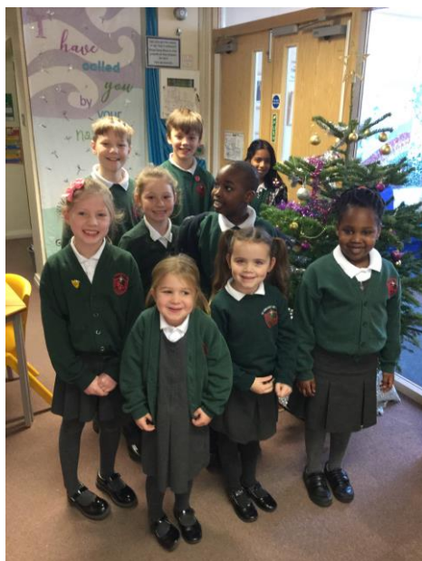
Children decorating the Christmas tree today